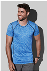
ST8840 Recycled Sports-T Reflect